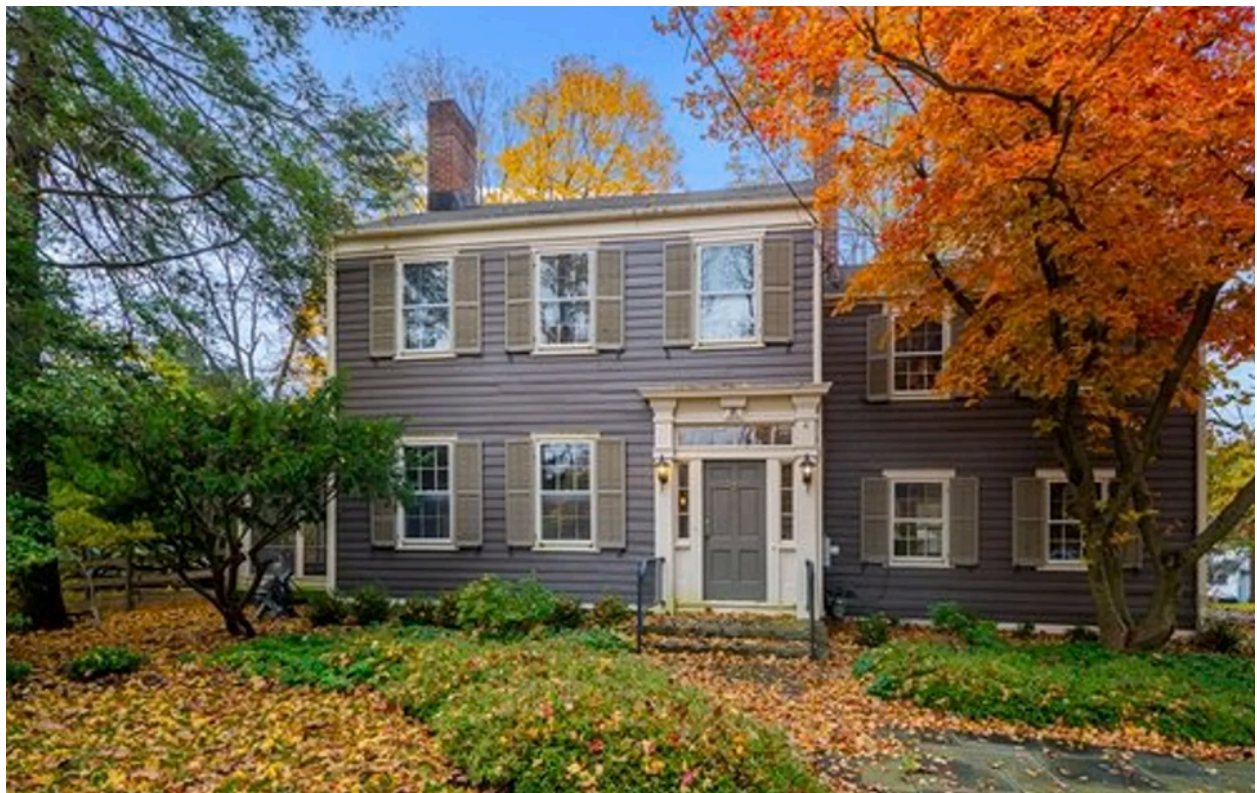
Now fully restored, the Murphy-Voorhees home at 60 Princeton Ave. in the historic District of Rocky Hill is now available for $795,900.